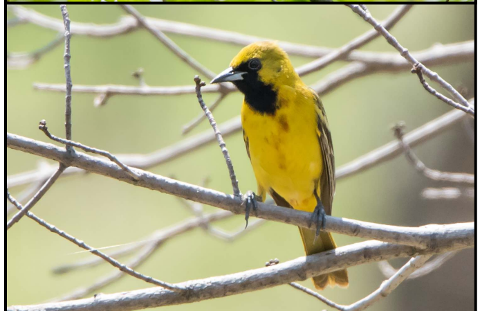
(Top to Bottom) Prairie Warbler at Bird Swamp in Cattaraugus County on May 24 th , Blackburnian Warbler at Bird Swamp in Cattaraugus County on May 24 th , Black-billed Cuckoo in South Wales on May 18 th , and Orchard Oriole (2nd year male) at Tifft Nature Preserve on May 8 th .